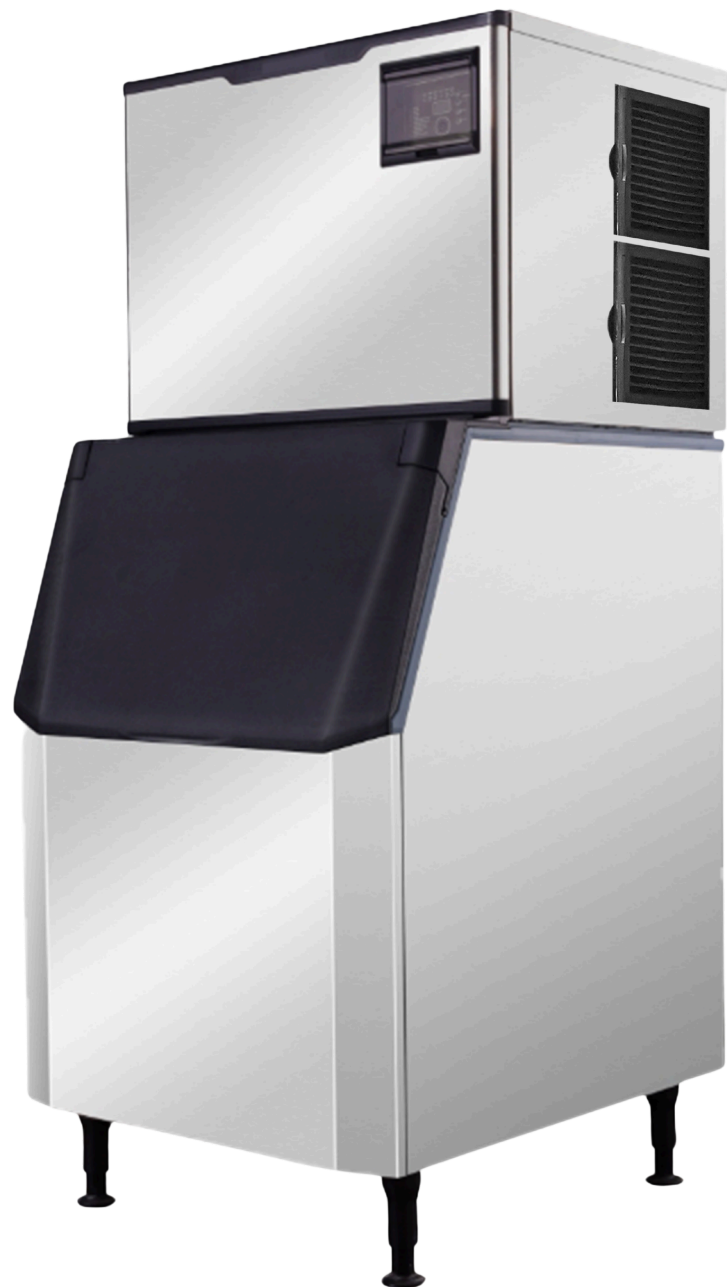
Image Shown with B-445 Ice Bin