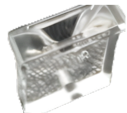
Half Cube (mm) 22 x 13 x 22