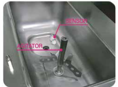
Agitator Mix out & mix low sensors