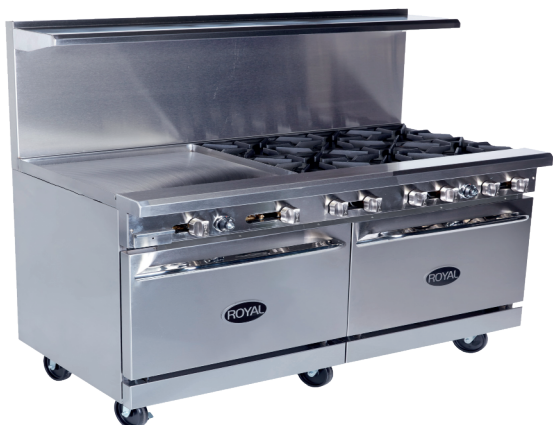
RR-6G24 with optional casters

Models: RR-10 RR-8G12 RR-6G24 RR-4G36 RR-2G48 RR-G60 RR-6RG24 RR-8GT12 RR-6GT24 RR-4GT36 RR-2GT48 RR-GT60