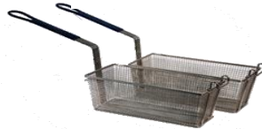
Two Half Baskets