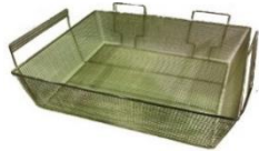
One Full Size Basket