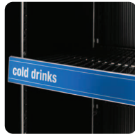
Clear, Hinged Menu / Price Strips