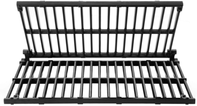
SPEEDY GRILL Mod. SG11L