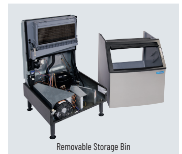
Removable Storage Bin