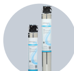
Arctic Pure Water Filters