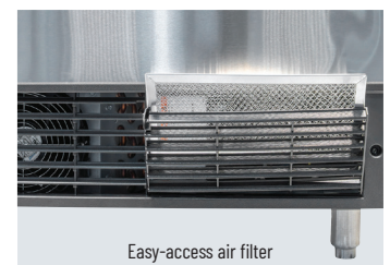
Easy-access air filter