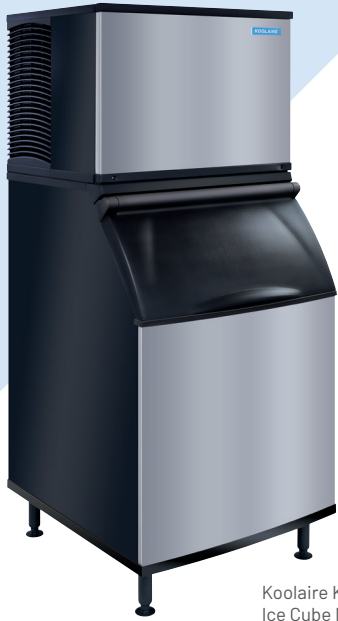
Koolaire KP0500 Ice Cube Machine on K-570 Bin