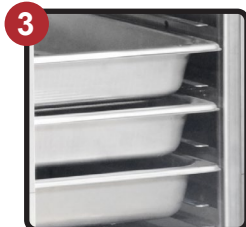
Convenient Fixed Rack Assembly