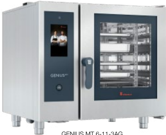
GENIUS MT 6-11-3AG