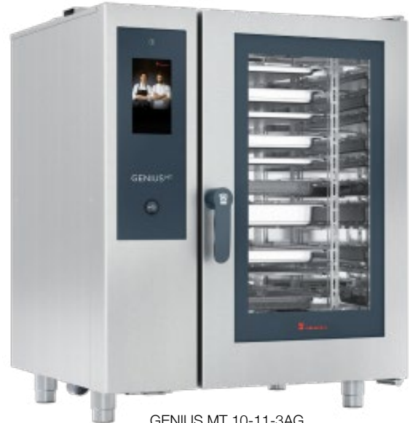
GENIUS MT 10-11-3AG