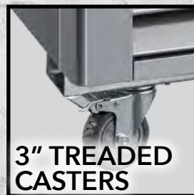
3" TREADED CASTERS