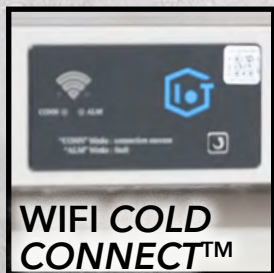
WIFI COLD CONNECT™