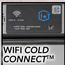
WIFI COLD CONNECT™