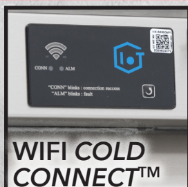
WIFI COLD CONNECT™