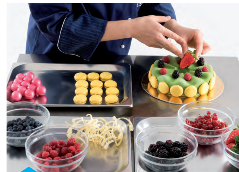
Finishing Decorations with fruit and chocolate curls transform the cake into a masterpiece.