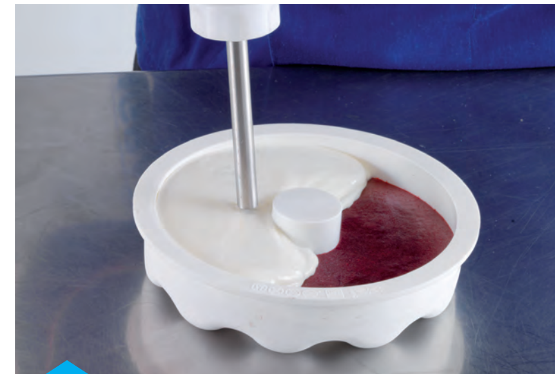
Filling With the pistol it takes no time to fill large gelato cake molds.