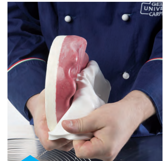
Extraction After freezing, the cake comes easily out of the mold.