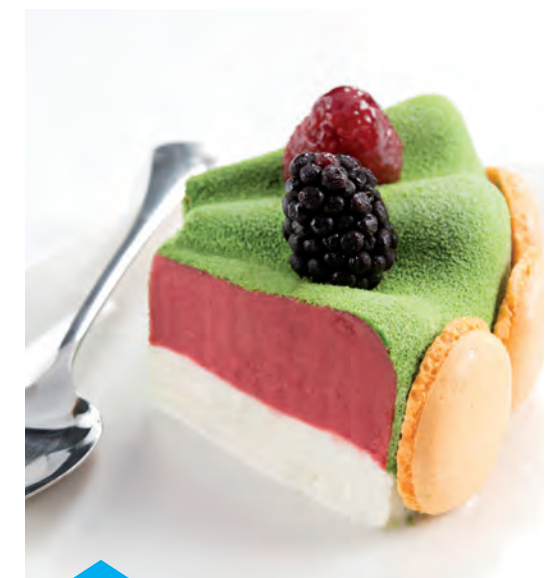
Multilayered gelato cakes This is the beautiful result that is possible only with Mister Art Plus.