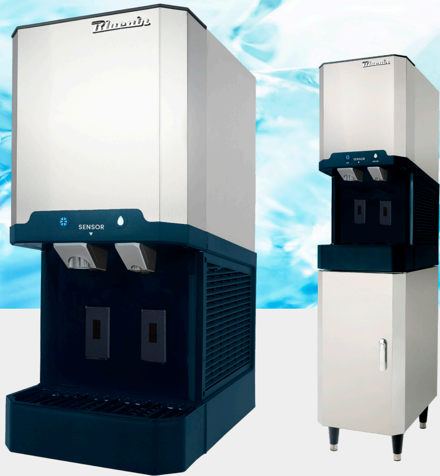
BLDN-280A-OS on BLDS-16-32 (Sold separately)