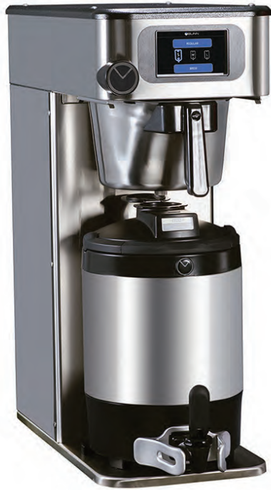
Infusion Series ICB-DV PE Dimensions: 10.0" x 26.8" x 23.4" (25.4 cm x 68.1 cm x 59.4 cm)