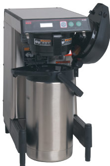
WAVE15-APS with 2.5 litre airpot (sold separately)