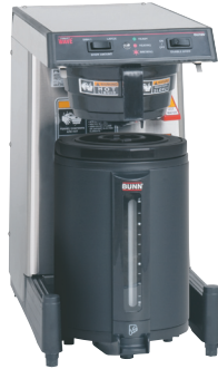
WAVE-S-APS with 2.5 litre Thermal Server (sold separately)