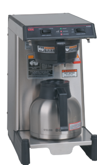
WAVE15-S-APS with 1.9L Thermal Carafe (sold separately)