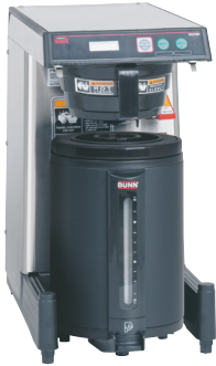
WAVE-APS with 2.5 litre Thermal Server (sold separately)