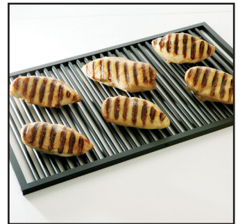
Grilling Grate 12" x 20" [325mm x 530mm] SH-26731