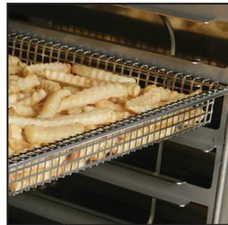
Fry Basket 12" x 20" [325mm x 530mm] BS-26730