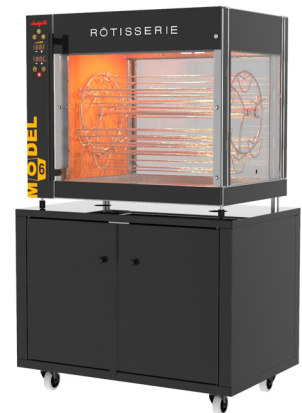
MODEL 6 WITH CUPBOARD AC 38